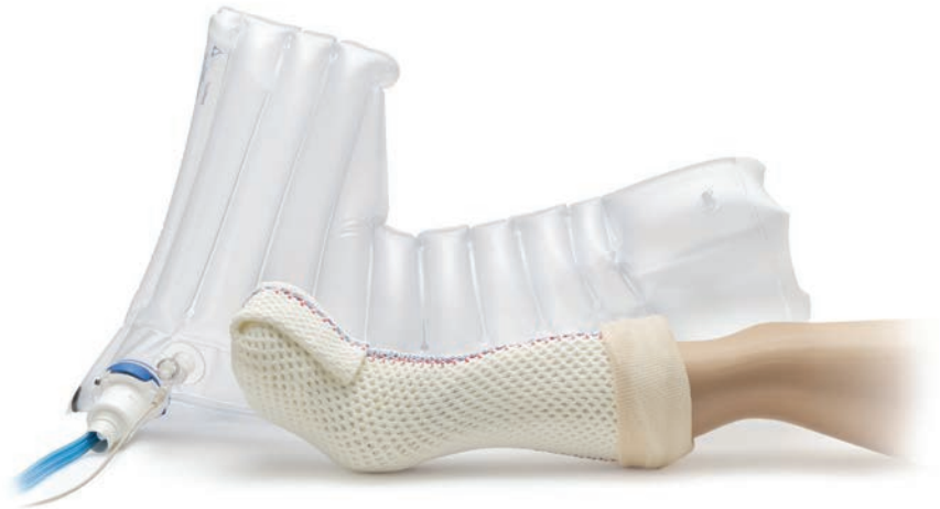
Large Boot Extremity Chamber

The simple to use TWO 2 therapy Single-Use Sacral/Torso units are uniquely sizeable for the targeted treatment of wounds of the torso, such as Pressure Ulcers of the Sacrum and Coccyx. This allows you to treat a variety of wound locations at any site of care.