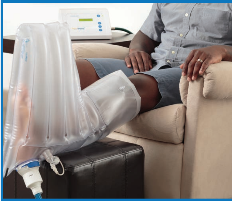
Single-Use Extremity Chamber

The TWO 2 therapy Extremity Chamber is available in medium and large versions to meet your specific patient needs. The system operates by applying cyclical oxygen pressure directly to the wound site within a sealed humidified environment. This provides a greater oxygen diffusion gradient and increased tissue oxygenation. TWO 2 therapy can be performed without removing gas permeable dressing, with the large version accommodating larger limbs and allowing diffusion through conventional compression dressings, UNNA Boot & total contact casts.