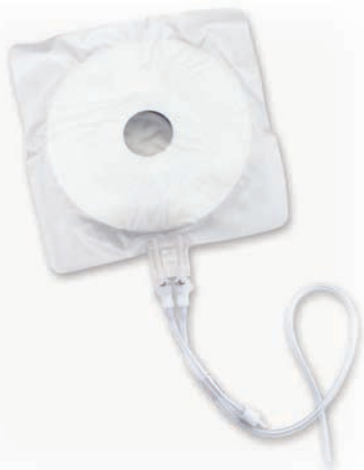
Single-Use Sacral/Torso Unit

The TWO 2 therapy Extremity Chamber is available in medium and large versions to meet your specific patient needs. The system operates by applying cyclical oxygen pressure directly to the wound site within a sealed humidified environment. This provides a greater oxygen diffusion gradient and increased tissue oxygenation. TWO 2 therapy can be performed without removing gas permeable dressing, with the large version accommodating larger limbs and allowing diffusion through conventional compression dressings, UNNA Boot & total contact casts.