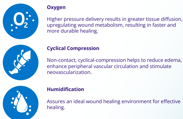
Figure 1: TWO 2 therapy has three component mechanisms: 1,8

The resultant oxygen partial pressure diffusion gradient of about 800 mmHg provides for maximum penetration of oxygen into the wounded tissue, penetrating into tunneling wounds, thereby stimulating healing at the deepest point of injury. 1,8