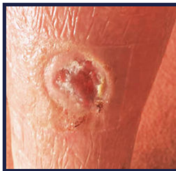
Day 19 of treatment