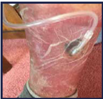
NEXA Dressing in situ

The wound size decreased markedly over the treatment period. At day 39 the wound was too small to continue with the NEXA System. The wound progressed to full closure within the next week using standard wound care.