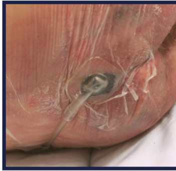
NEXA Dressing in situ