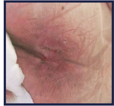
Day 10 of treatment

"The NEXA NPWT System is an excellent product. It has the advantages of being simple to use and inexpensive when compared to other products. Overall, every nurse enjoyed using the NEXA System and the patient, who had experience with other NPWT systems (and hated the thought of using it due to the alarm constantly waking her) was grateful for the fact the NEXA System did not wake her once, the therapy pump noise did not disturb her in the least and the wound is certainly in a healing state."